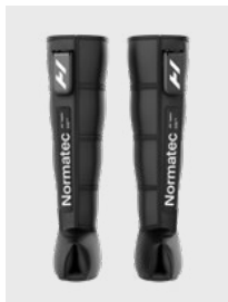
Dynamic air compression